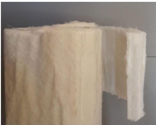
10 mm Thickness

IRogel® is an opacified aerogel blanket for effective blocking of the radiation component of heat transfer. It delivers excellent thermal insulation up to 1200°F (650°C) for applications including aerospace, transportation, industrial equipment, power generation, high-temperature thermal and fire protection.